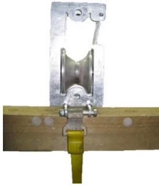
Single Cross Arm Ratchet Mounted

Available single or duo rollers, they can either be mounted on top of the cross arm with a ratchet belt or hung below the cross arm with a hanging eye. They can be used with or without the Heli Horn.