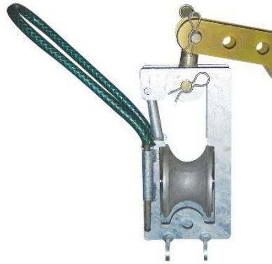
Single Cross Arm Hanging w\ Heli Horn