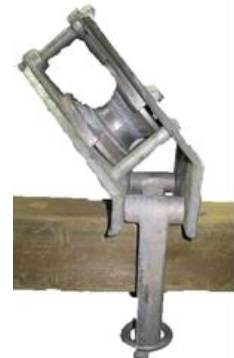
Angle Triangle Cross Arm Roller mounted on Cross Arm with Solid Legs