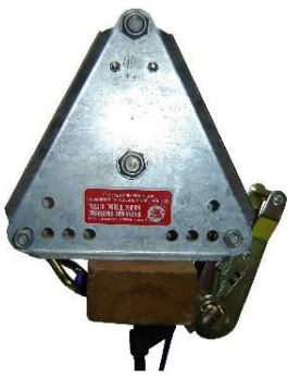
Straight Triangle Cross Arm Roller mounted on Cross Arm with Ratchet Belt

This Cross Arm Roller has a straight or angle option. Both are better suited for being mounted on top of the Cross Arm. The Straight Cross Arm Roller is mounted to the cross arm with a ratchet belt and the Angled Cross Arm Roller is supplied with Solid Legs to mount it onto the cross arm.