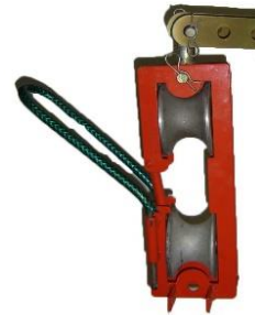
Duo Cross Arm Hanging w\ Heli Horn