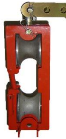
Duo Cross Arm Hanging