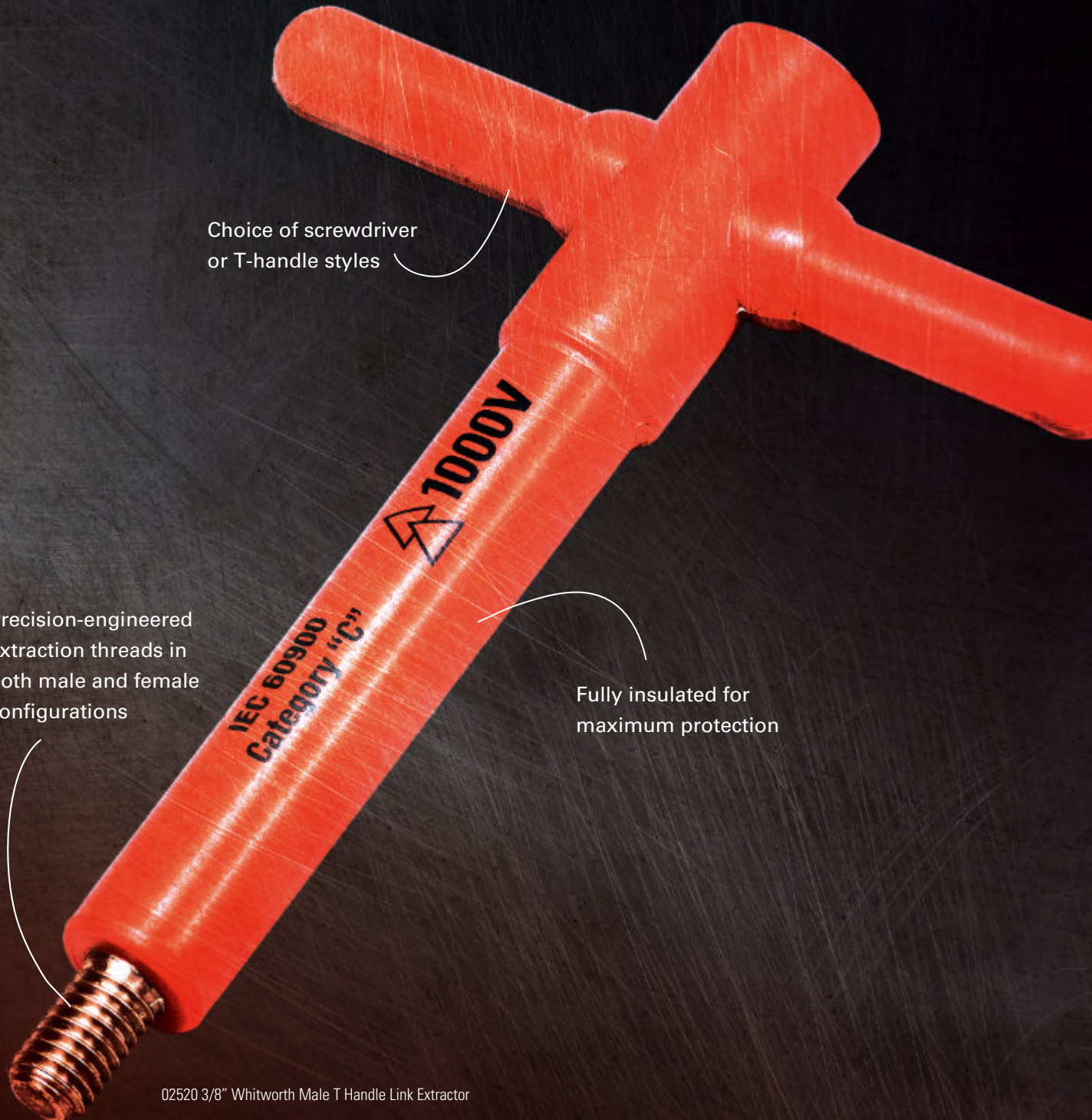
02520 3/8" Whitworth Male T Handle Link Extractor