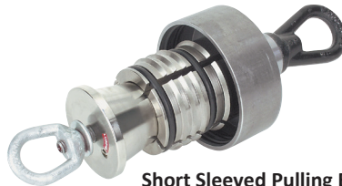
Short Sleeved Pulling Eye (page 55)