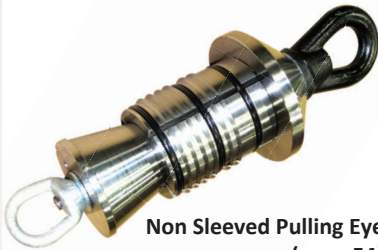
Non Sleeved Pulling Eye (page 54)