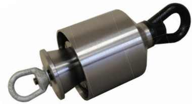
Long Sleeved Pulling Eye (page 55)