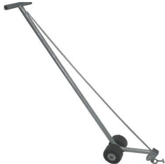
Manual Manhole/Pit Lid Lifter

Place the lifting eye in the lid slot, leverage down on the lifting bar and wheel the lid out of the way once it has lifted out of the manhole.