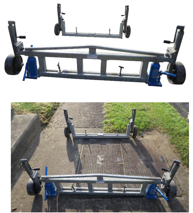
Hydraulic Pit Lid Lifter