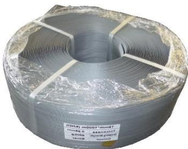
Grey Strapping Tape

Powerhouse Electric also supplies optional Polypropylene tape, which is strong, flexible, lightweight, and easy to use.