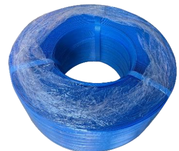
Blue Strapping Tape

Powerhouse Electric also supplies optional Polypropylene tape, which is strong, flexible, lightweight, and easy to use.